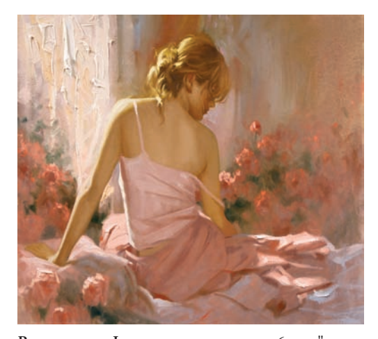
Blossoms in Light, oil on canvas, 16 x 20"