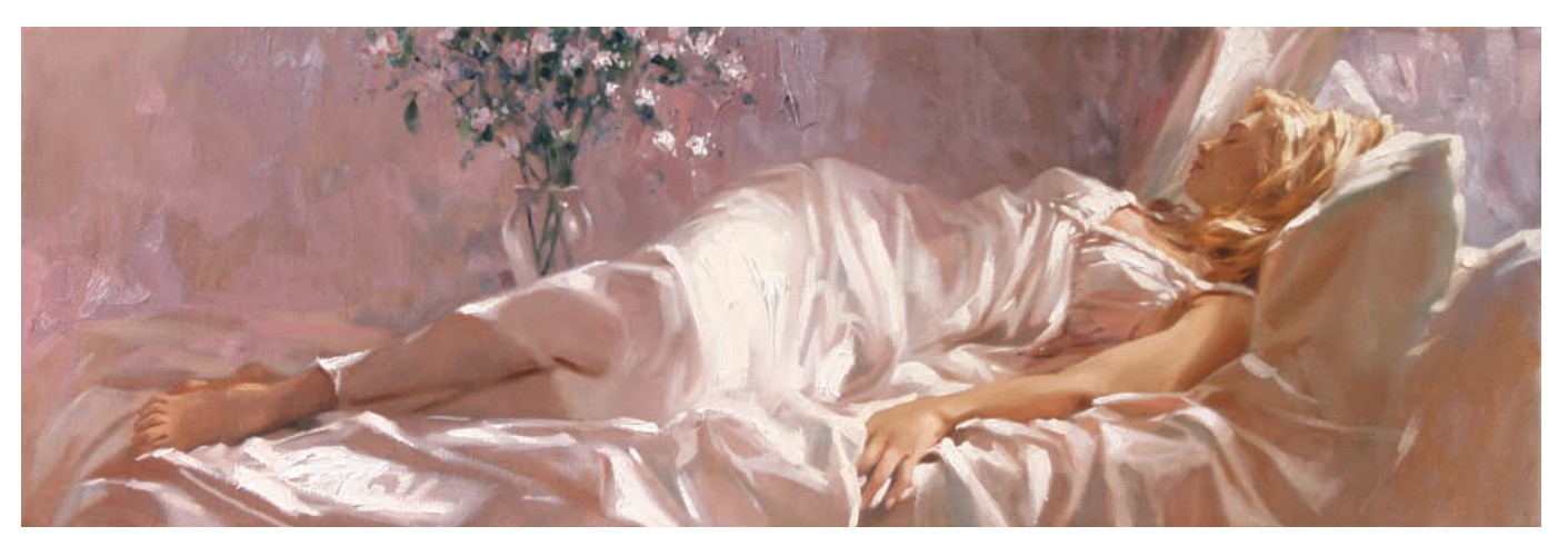
Dusk, oil on canvas, 12 x 36"