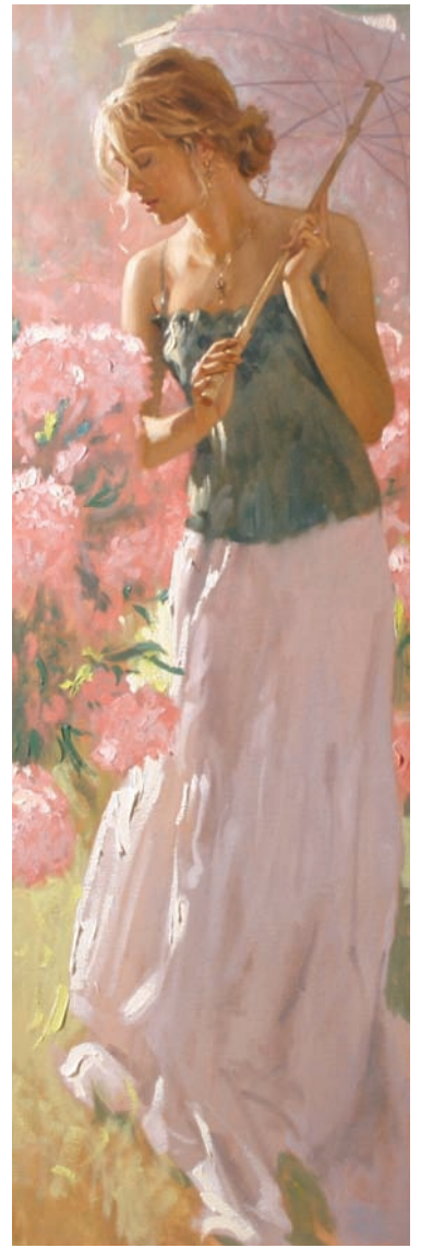
Pause, oil on canvas, 36 x 12"